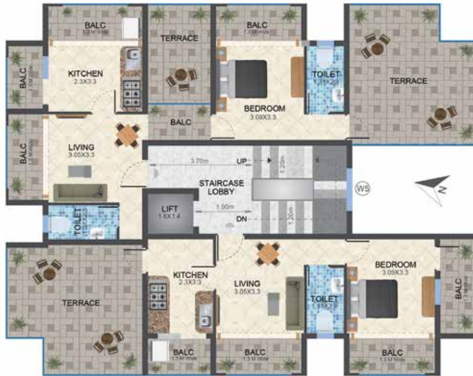
3 rd FLOOR PLAN