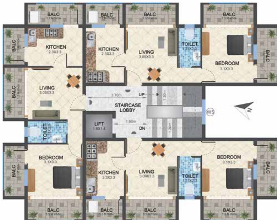
UPPER GR, 1 st & 2 nd FLOOR PLAN